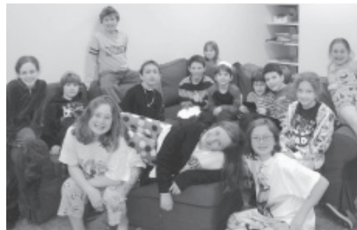
Machar was the first group to enjoy our newly furnished Youth Lounge

(703) 569-6770 - Springfield: 6220 Rolling Road Between Traford and Bauer