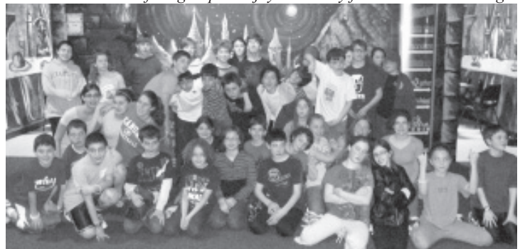
Machar and Kadima members at Shadowland Laser Adventures