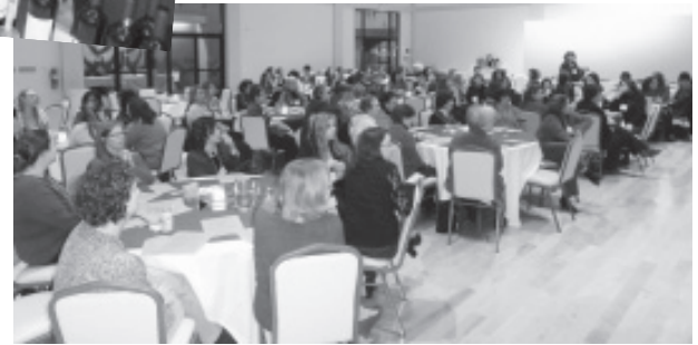
Sisterhood members learn about wine