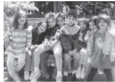
Above, Pajama Day.