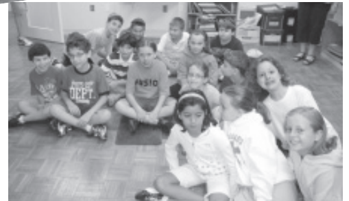
Fourth graders gather in the Resource Room for music, where they practice the Shecheyanu blessing and Ha'Tikvah.