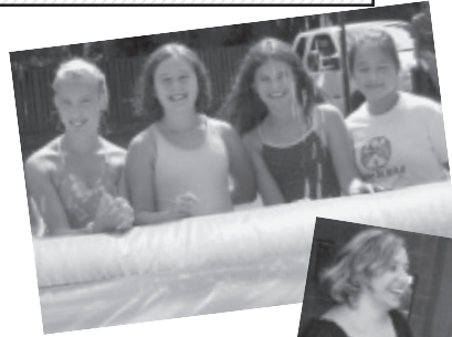
Machar and Kadima members wait for their turn on the giant inflatable water slide at our kick-off event.