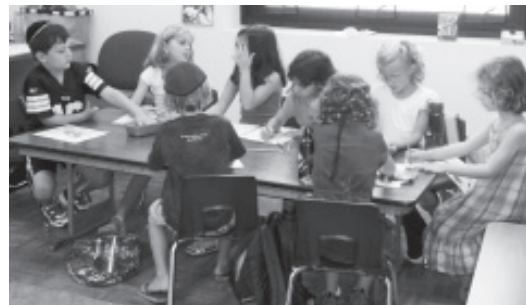
Our first graders practice writing the Hebrew letter shin and add their own creative touch.